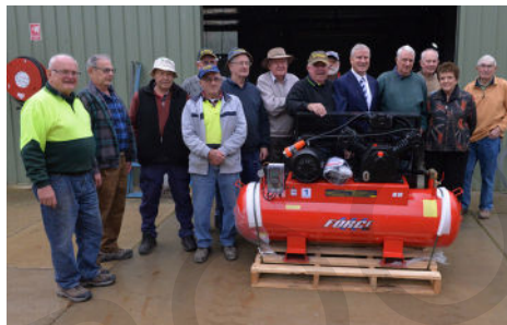
AIR APPARENT: With members of Wagga Wagga Men's Shed, which received $3,750 to buy new equipment, including an air compressor.