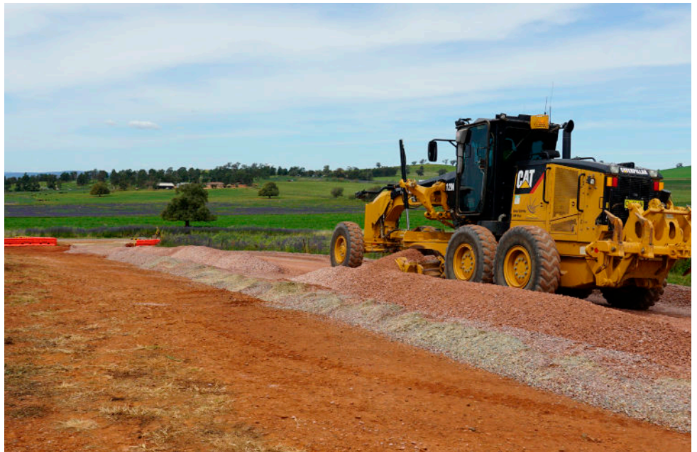
GETTING ON WITH THE JOB: Early works have already started for the Parkes bypass on Nock Road, just north of the town.

The Parkes Bypass is great news for locals, for businesses and for the future of the region, with many communities, farmers and businesses across the Central West, Murrumbidgee Irrigation Area and western NSW relying on the highway to get their products to shelves, remain connected to jobs and vital services, such as health, and