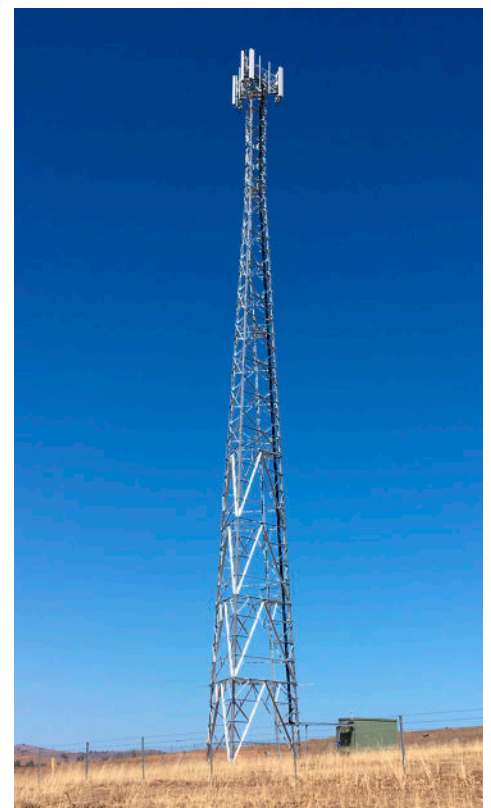
DELIVERING: The Nationals have helped to deliver more than 880 base stations across the country through the Mobile Black Spot Program, including this one at Wantabadgery.

The network investment plan includes $3.5 billion to make NBN Co’s highest wholesale speed tiers available, on demand, to up to 75 per cent of homes and businesses on the fixed-line network by 2023. Additionally, NBN Co will invest $700 million to enable nine in 10 businesses to order high-speed fibre broadband at no upfront cost as NBN Co rolls out 240 Business Fibre Zones across Australia, 85 of which will be located in the regions, including at Wagga Wagga.