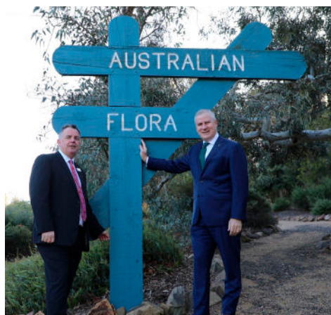
POPULAR TOURIST SPOT: With Wagga Wagga Deputy Mayor Dallas Tout after announcing the Botanic Gardens was to receive $4,288,879 in Federal Funding for the Botanic Gardens Precinct Renewal project.

This round will complement other actions the Government has taken to support regional tourism through the Relief and Recovery Fund as well as the $50 million Regional Tourism Recovery initiative.